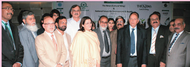
A group photo of Speakers and Organizers with Governor Punjab Ch. Muhammad Sarwar

rights. However, we told them that over 50,000 people sacrificed their lives during ongoing war on terrorism while thousands other military men rendered similar sacrifices. The overall financial impact of this war has been calculated